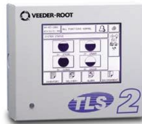
Electronic Gauging with outputs for BMS