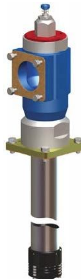
80mm Overfill Prevention Valve