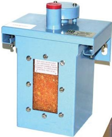
Silica Gel Vent Dryer