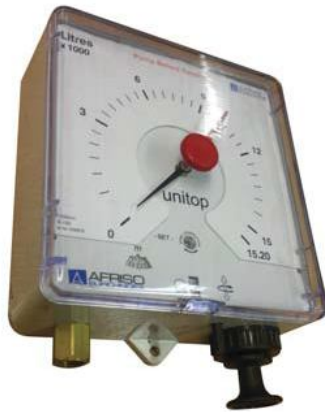
Gauge in litres