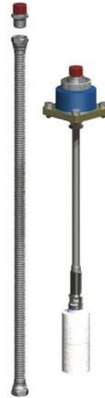
Adjustable OPV Float Kit