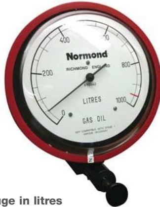
Gauge in litres