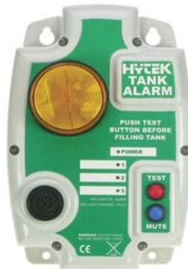
Overfill & Bund Alarm 230V ac or Battery powered (Volt free contacts included)