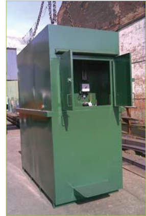
A built in end security cabinet. A standard feature.

Compliance with the control of pollution regulations.